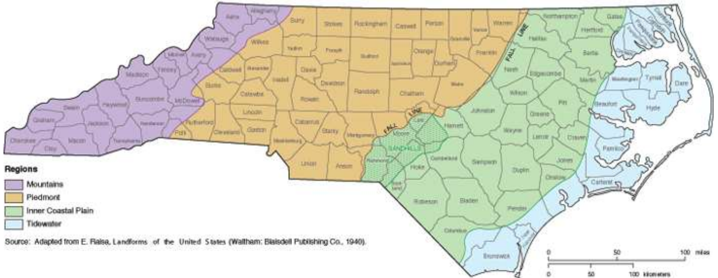
Figure 1a. Physical Regions

Source: Adapted from E. Raisz, Landforms of the United States (Waltham; Blaisdell Publishing Co., 1940).