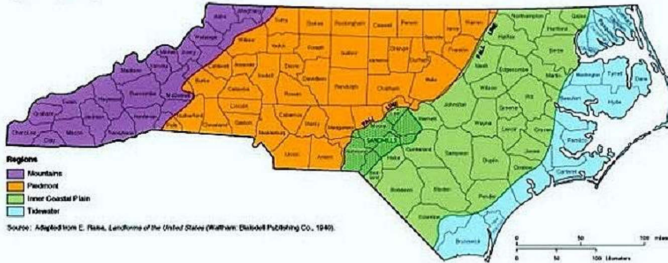
Figure 3.1. Physical Regions