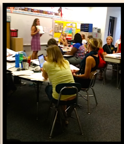
Leesville Teachers teaching Leesville Teachers ...a great show of collaboration