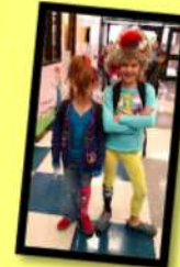
Team Spirit Day