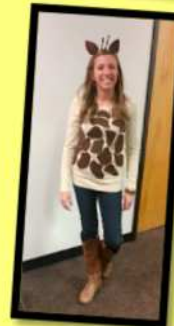
Tropical Paradise Day