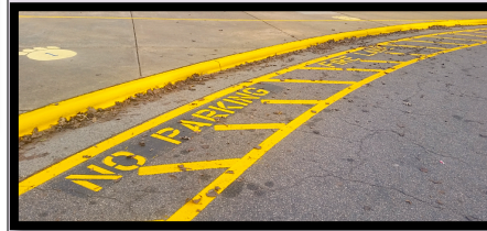
The POPI of the newly painted yellow will certainly allow us to maintain greater safety for our students.

Our hope is that the POPI of the yellow serves as a reminder for our students about safety on the bus-lot walkway and also that we must keep the front car circle clear along all fire lanes... all of which are very clearly marked.