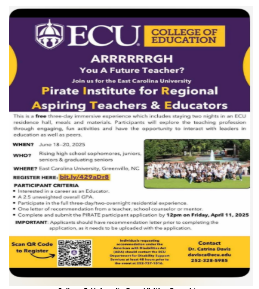
College & University Reps Visiting Broughton

Rising high school seniors stay on a college campus for a few days and get a taste of the college experience with all expenses paid by Swarthmore. Broughton's deadline for submitting nominations is Sunday, June 15, 2025.