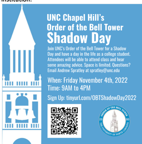
College & University Reps Visiting Broughton

For Juniors who hope to attend a college or university, whether it is Carolina, a UNC system school, or another institution: