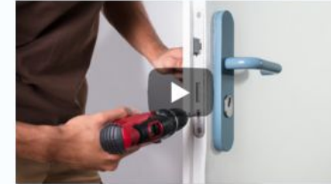
Apartment maintenance technician Repair and perform maintenance on electrical, plumbing, HVAC systems and more.