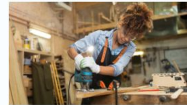
Carpenter Read blueprints and construct building frameworks, including walls, floors and door frames.