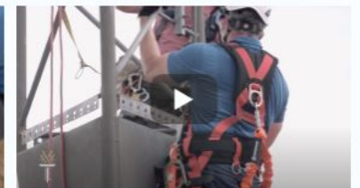
Tower technician Specialize in the installation, maintenance and repair of equipment on telecommunications towers.