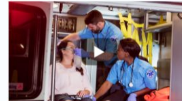
EMT Learn essential skills to stabilize and safely transport patients in emergency and non-emergency situations.