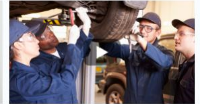
Automotive systems Automotive service technicians are in high demand at dealerships and auto service centers across the Triangle.