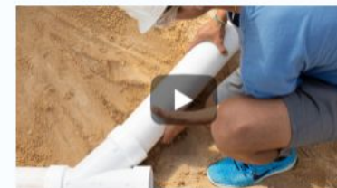
Plumber Install and repair plumbing systems, including water pipes and drains, in residential and commercial buildings.