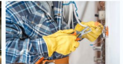
Electrician Install and maintain electrical wiring systems across a variety of environments.