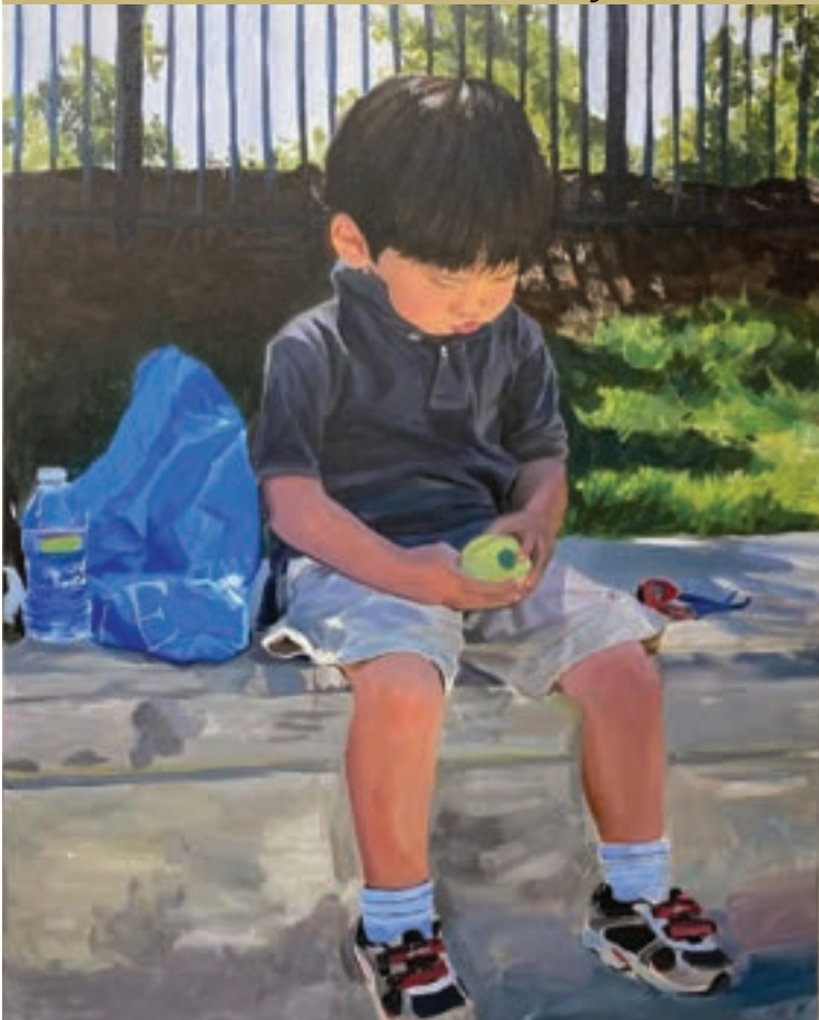
Artwork by Edward Zhu

Incoming students who have prior art experience and wish to enroll in the Visual Arts Program may present a portfolio to determine course placement (see the Arts website for additional details). No prior experience? No problem! Sign up for the Visual Arts - Beginning course.