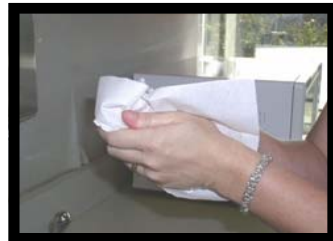
Dry with a paper towel.