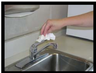
Turn off water with paper towel.