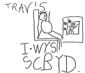
"I watched Scooby Doo."