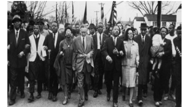
55 years ago the march from Selma, Alabama to the capital in Montgomery took place.