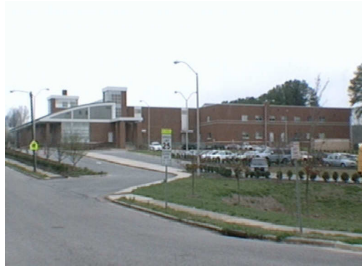
The entire school facility was renovated in 2000, and a new classroom wing and auditorium were added.