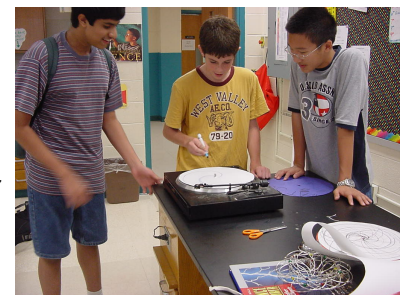
Unique electives spark learning.